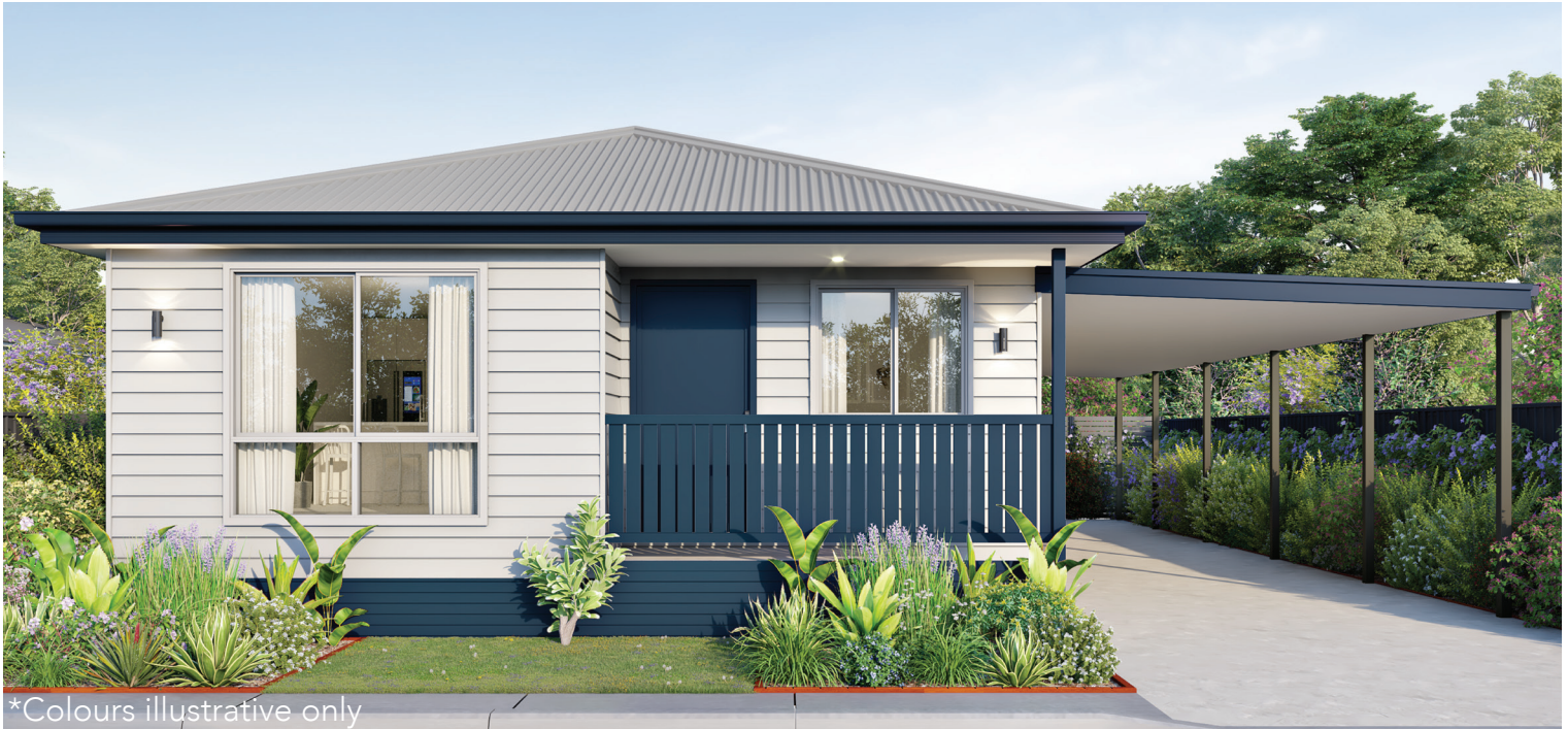
*Colours illustrative only